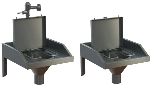
Slop Hopper with lid (Model SHL)