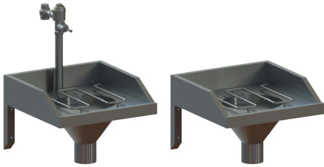
Slop Hopper (Model SH)