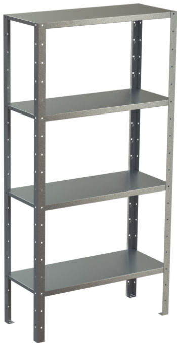
Solid Floor Type Shelving