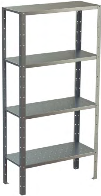
Perforated Floor Type Shelving